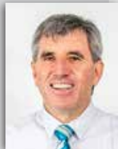
Pr Colin Renfrew General Secretary